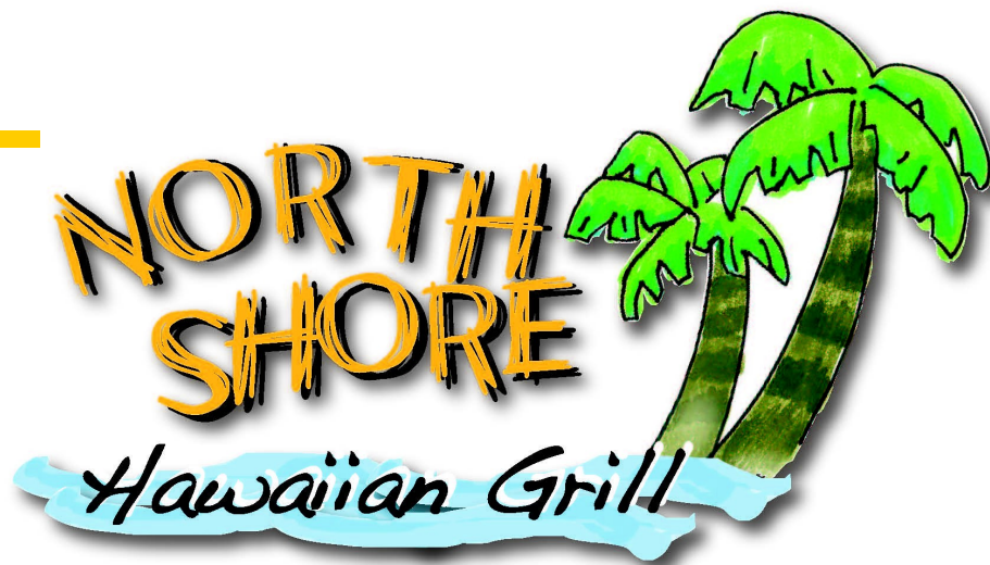
Plate Lunches and Dinners

Our plate lunches and dinners are served authentic Hawaiian Style with sticky white rice and island style macaroni salad.